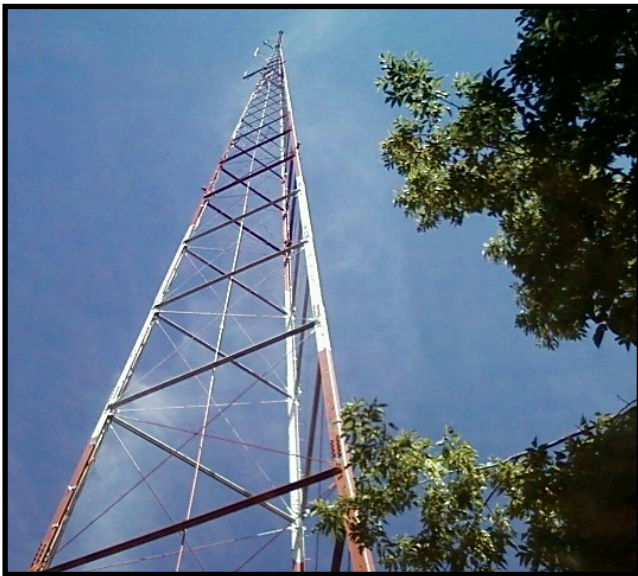
Good Shepherd Catholic Radio tower.