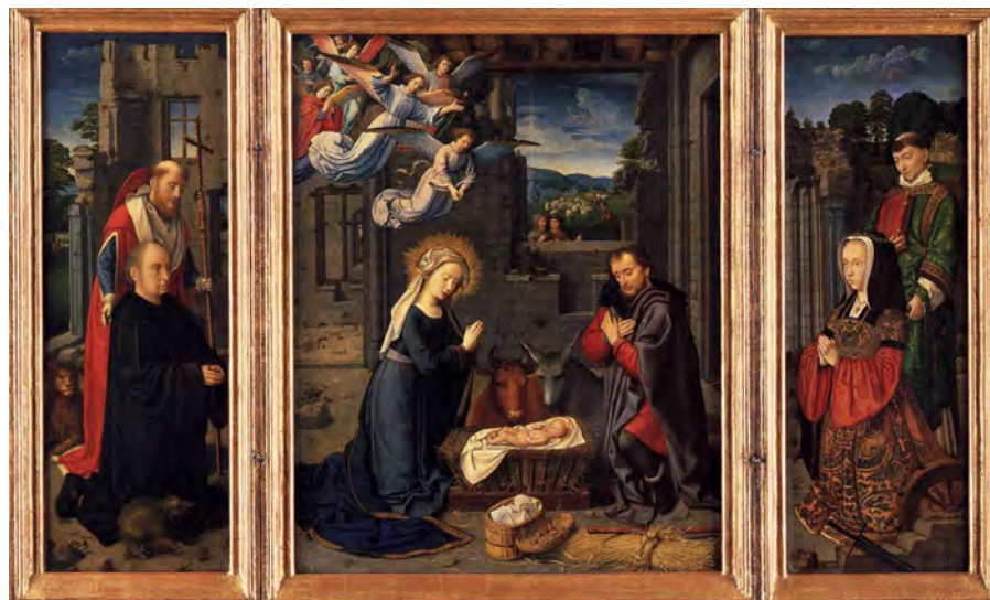
Tryptych w/ The Nativity c.1505 Gerard David

Good Shepherd Catholic Radio wishes a Happy Thanksgiving, a Blessed Advent, and a Happy New Year to everyone in the Jackson catholic community. Let’s all give thanks to the Lord for the many blessings he has graciously bestowed.